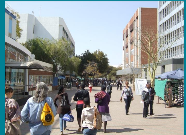
Gaborone, City Centre