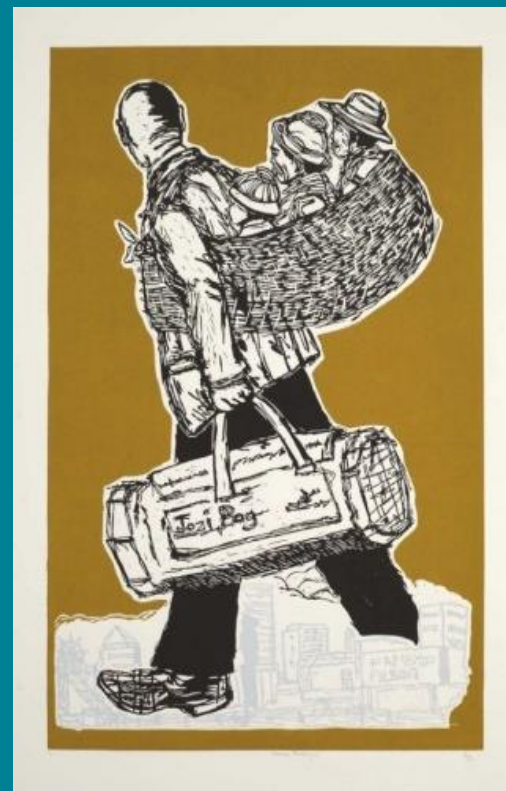
Obsession, Senzo Shabanugu