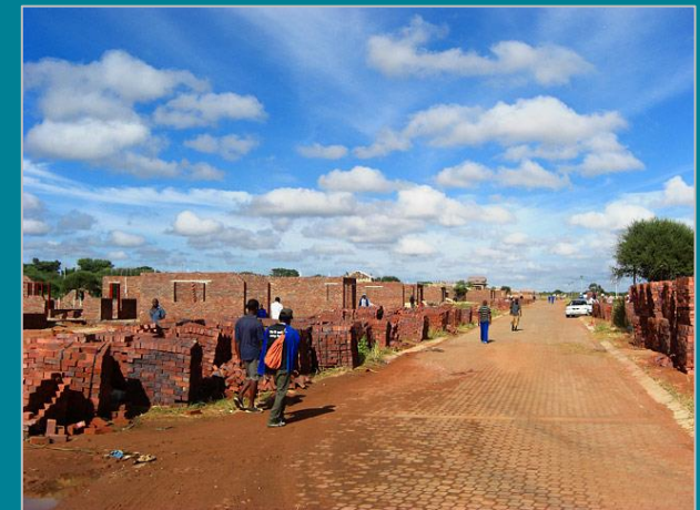
Building houses in Lephalale