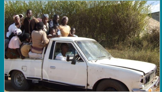
Mozambicans on the move