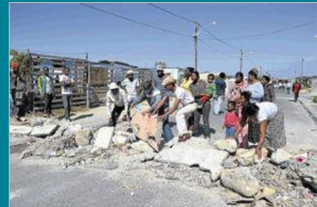
Philippi, Cape Town